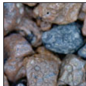
Water Tumbled Scoria