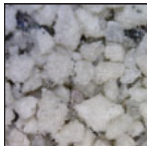
Mt. St. Helens Ash