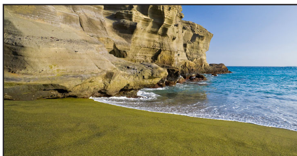
Olivine Sand Beach