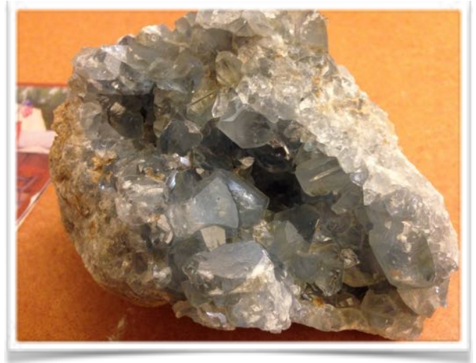
Strontianite (specimen brought to May meeting)