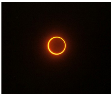
Eclipse of Sun

Don't wait around for the next one because it won't occur again until 2117.