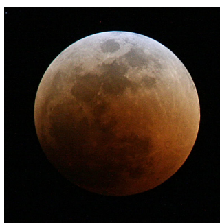
Eclipse of Moon