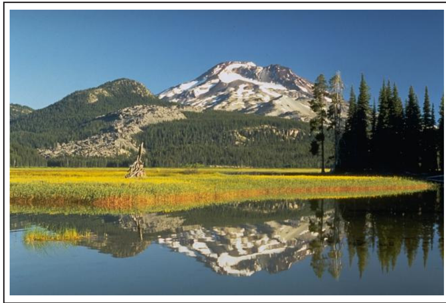
South Sister - Oregon Last Eruption - 50 BC (?) 10,357 feet 44.103° N 121.768° W