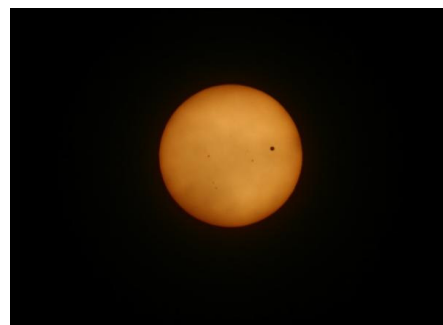
Venus Transit (Small Black Dot at 2:30)