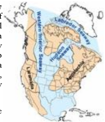
Inland seas 100 mya

Tylosaurus and Pteranodon became the Kansas State Fossils in 2014.