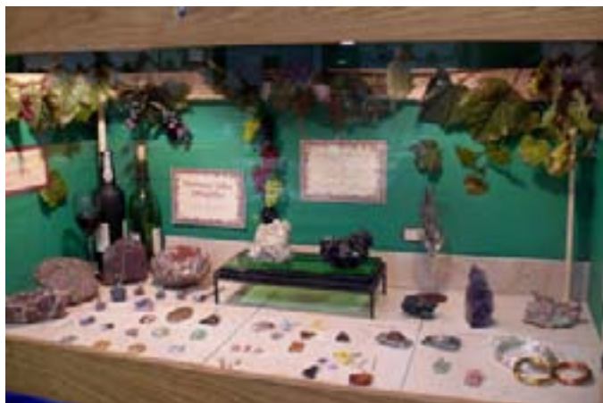
Diane Day - Lithophiles County Fair Case

Photos from Lithorama 2010 All photos (pg. 5 & 6) by Bob T. except In The Beginning by Bill B.