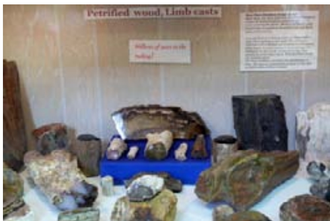
Al Hess - Petrified Wood