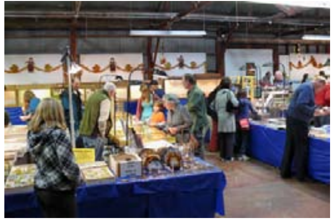
The Barn after Transformation