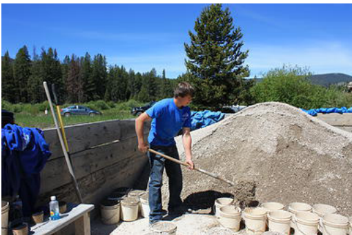
Gravel containing Sapphires

Gem Mountain in Montana was first developed in the 1890's and has since produced more than 180 million carats of sapphires! Sapphires are some of the rarest gemstones in the world, but not here. Gem Mountain in Montana is the source for every known color of sapphire and some colors found nowhere else. When heat treated and faceted they have a brilliance that can't be beat by gems from anywhere else in the world.