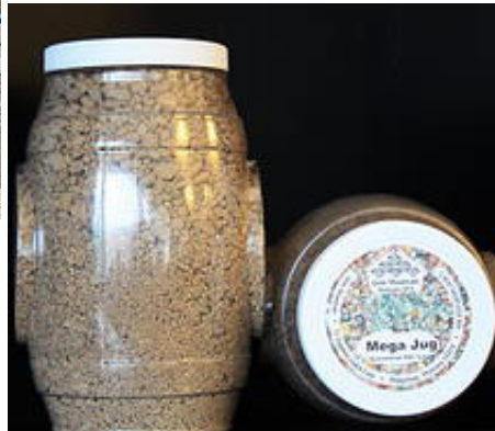
Gravel As Shipped