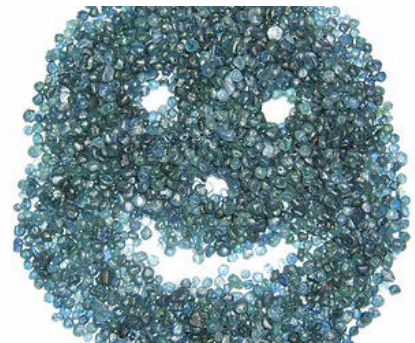
Sapphire High Grade